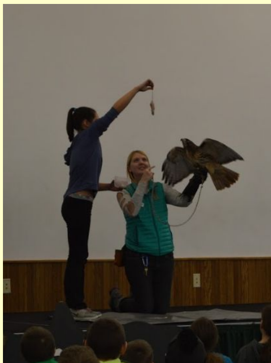
Feeding a raptor...