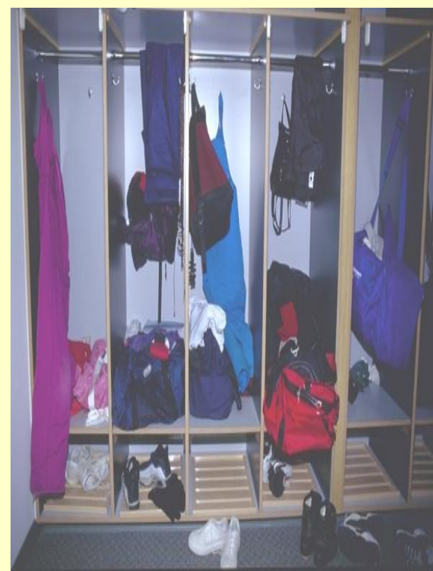
Eagle Bluff Dorm Life