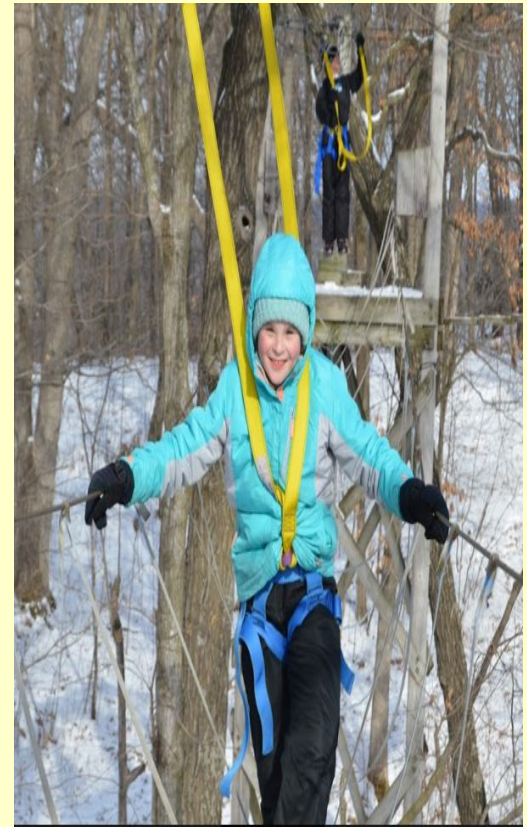
High Ropes Course