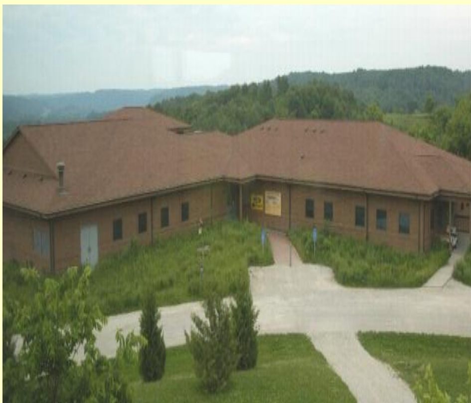
The Discovery Center