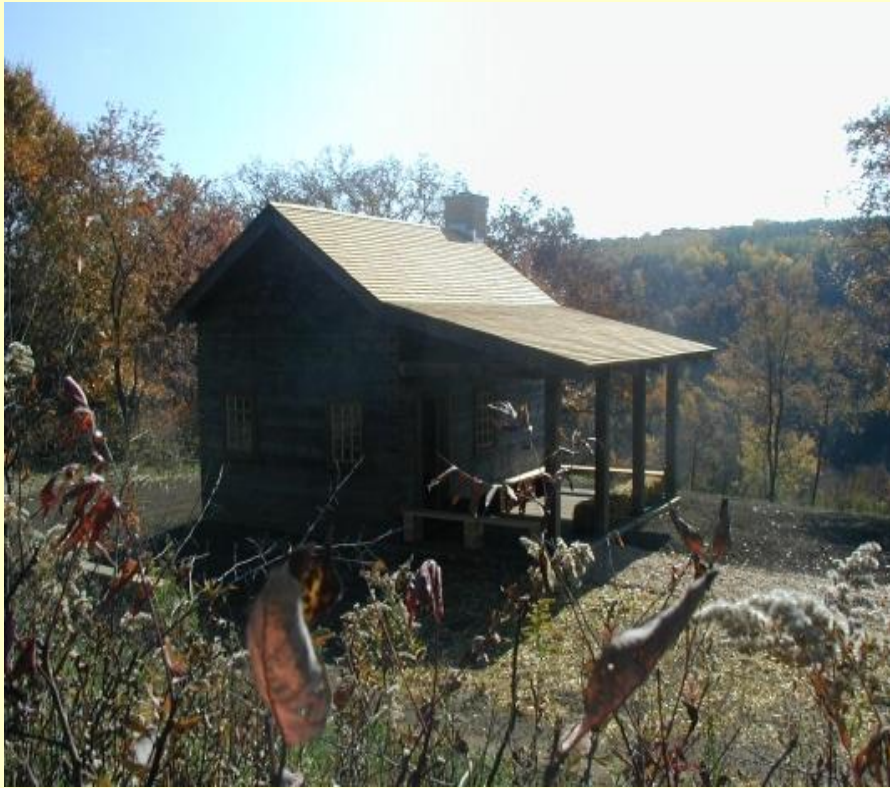
The Pioneer Shack